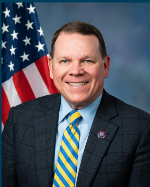
Rep. Sam Graves

In this issue of Capitol Currents, we profile another elected official who has championed the inland waterways: Congressman Congressman Sam Graves (R-MO)