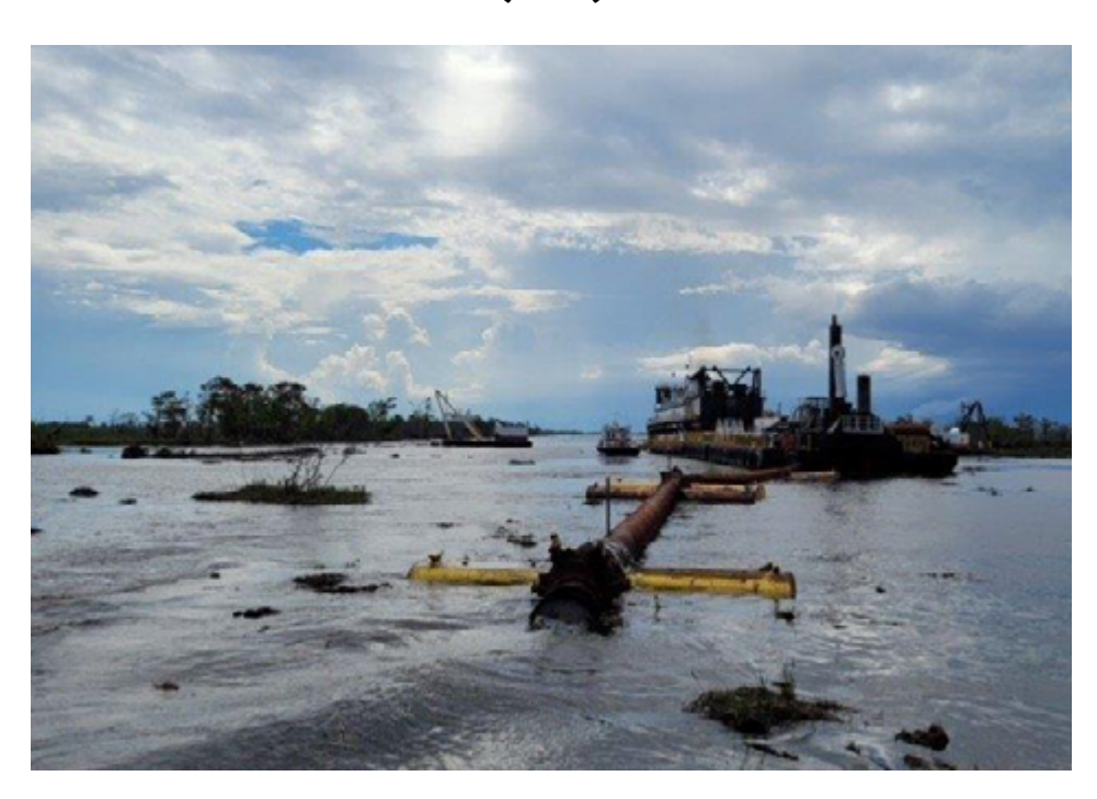
Hurricane Ida, with its more than 150 mph winds that resulted in scattered debris as shown, made it the second most damaging storm to the state of Louisiana behind Hurricane Katrina. Here, a drag line crane removes vegetative and other debris ahead of the cutterhead dredge.

n late August, Hurricane IDA made landfall in south central Louisiana as a Category Four hurricane bringing tremendous devastation to many parts of the state including near epic level shoaling along the Gulf Intracoastal Waterway. The area most heavily impacted is located approximately 15 to 20 miles west of the Algiers Canal between Houma and New Orleans, LA in the vicinity of the intersection of Bayou Perot, Lake Salvador and the Gulf Intracoastal Waterway, an area known for routine shoaling. Post storm, a two mile stretch of the Gulf Intracoastal Waterway was surveyed and the available draft had been reduced to as low as only two feet post storm with an additional 10 miles reduced to only seven feet. The severe shoaling required the closure of the Gulf Intracoastal Waterway to facilitate the initiation of emergency dredge contracts by the U.S. Army Corps of Engineers to clear not only tons of silt deposited in the channel but also massive amounts of vegetative debris which had also been deposited in the main navigation channel. The U.S. Army Corps of Engineers very quickly deployed a large contract cutter head dredge and a large drag line crane which works ahead of the cutter head dredge to clear solid debris which may impact the dredge's ability to address the shoaling. The U.S. Army Corps of Engineers New Orleans District estimates it will take approximately four more weeks before the Gulf Intracoastal Waterway can be reopened to routine maritime traffic.