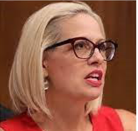
Senators Joe Manchin (D-WV) and Kyrsten Sinema (D-AZ) have become integral in the negotiations on a reconciliation bill that holds the infrastructure bill in the balance.

Pelosi that the infrastructure bill would hit the House floor by September 27, that infrastructure deadline has come and gone. So, what's next?