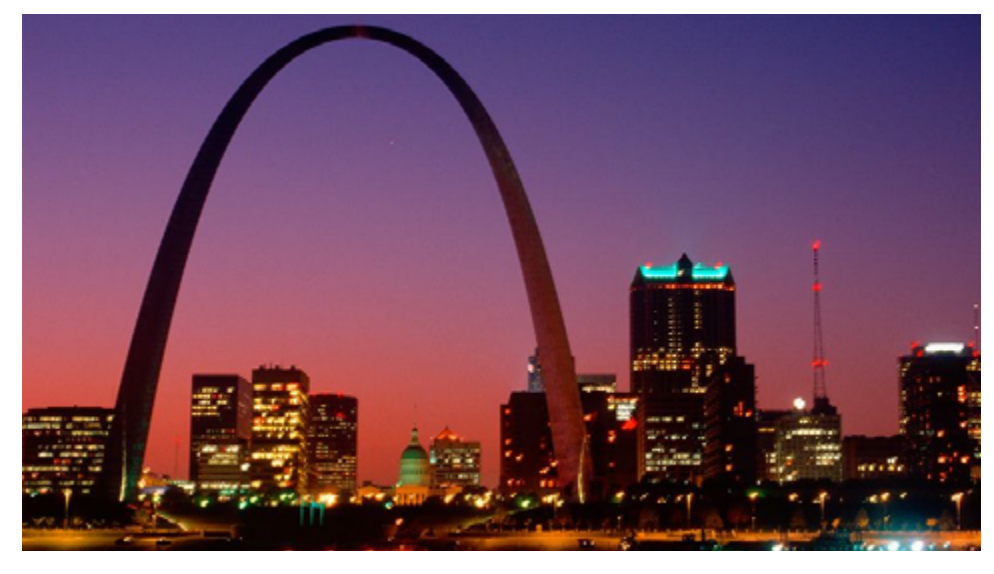
Over-arching discussions expected November 2-4 at WCI's Annual Meeting and Waterways Symposium.