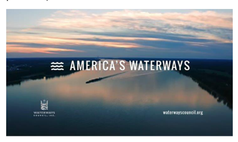
"America's Waterways" is the theme of WCI's new TV spot being aired inside the Beltway that has garnered more than four million impressions since its initial airing.

WCI members are asked to share these educational assets on your social media platforms today. �