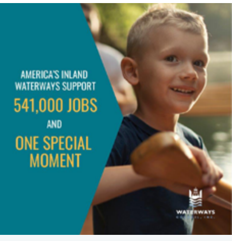
WCI's educational campaign highlights the importance of the inland waterways for capacity, and to agriculture, shippers, jobs and quality of life.