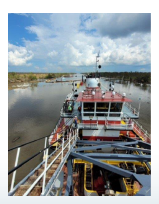
A cutter head dredge in operation clearing silt from the channel post-storm.