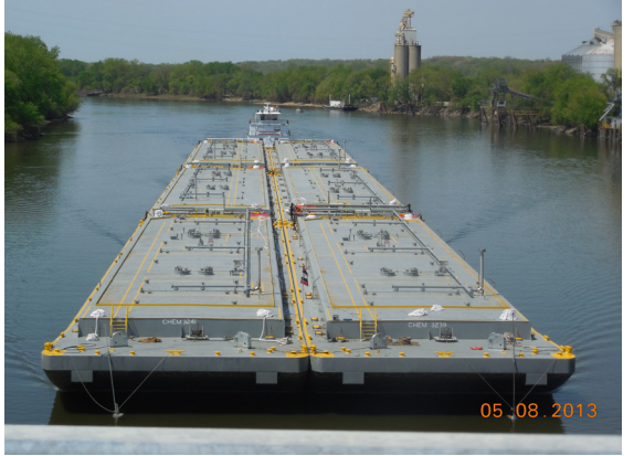
The company's newer tank barges have 6psi tank tops, heavy hull scantlings, and stainless steel external fittings.

barges and towboats. It offers open and covered hopper barges, chemical and petroleum tank barges, deck barges, and towboats for long term charter. The company also provides specialized technical advice, as well as detailed construction contract and project management support. With well over 1,000 vessels in its fleet, J. Russell Flowers, Inc. offers creative solutions to a wide range of barg-