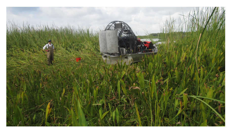
The Institute is working to engineer holes in levees to allow sediment and freshwater to flow into marshes in Louisiana to build and sustain land.

Officially founded in late 2011, the vision for what would become The Water Institute of the Gulf (Institute) started years before, in the destructive aftermath of hurricanes Katrina and Rita in 2005. Delegations of Louisiana policy makers, elected officials, foundations, and community leaders made multiple trips to the world-renowned water management institute in the Netherlands – Deltares. It wasn't long before these delegation members decided they wanted a dedicated applied-science institute of their own.