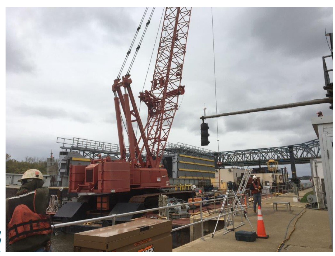
Eight lock and dams sites on the Illinois Waterway need repair.

The Rock Island District, and certainly our Operations Division which oversees our navigation mission, is dedicated to ensuring the health and reliability of the Illinois Waterway. The 2020 and 2023 closures will be a challenge for many who depend on this river system, but the necessity of the closures coupled with the long-term benefits will make this challenge worthwhile for all of us. •