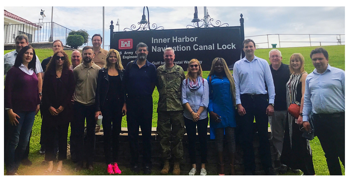
The Ukrainian waterways delegation stands with Col. Mike Clancy, New Orleans District Engineer, USACE, at Inner Harbor Lock in New Orleans during its U.S. visit.