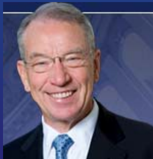
Sen. Chuck Grassley (R-IA)