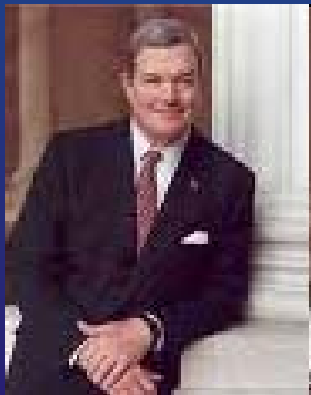
Sen. Kit Bond (R-MO)