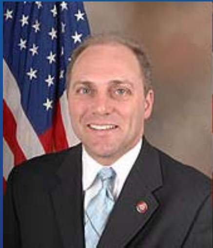
Cong Steve Scalise (R-LA)