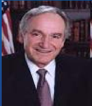
Sen. Tom Harkin (D-IA)