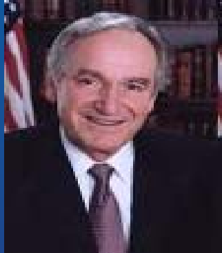
Sen. Tom Harkin (D-IA)